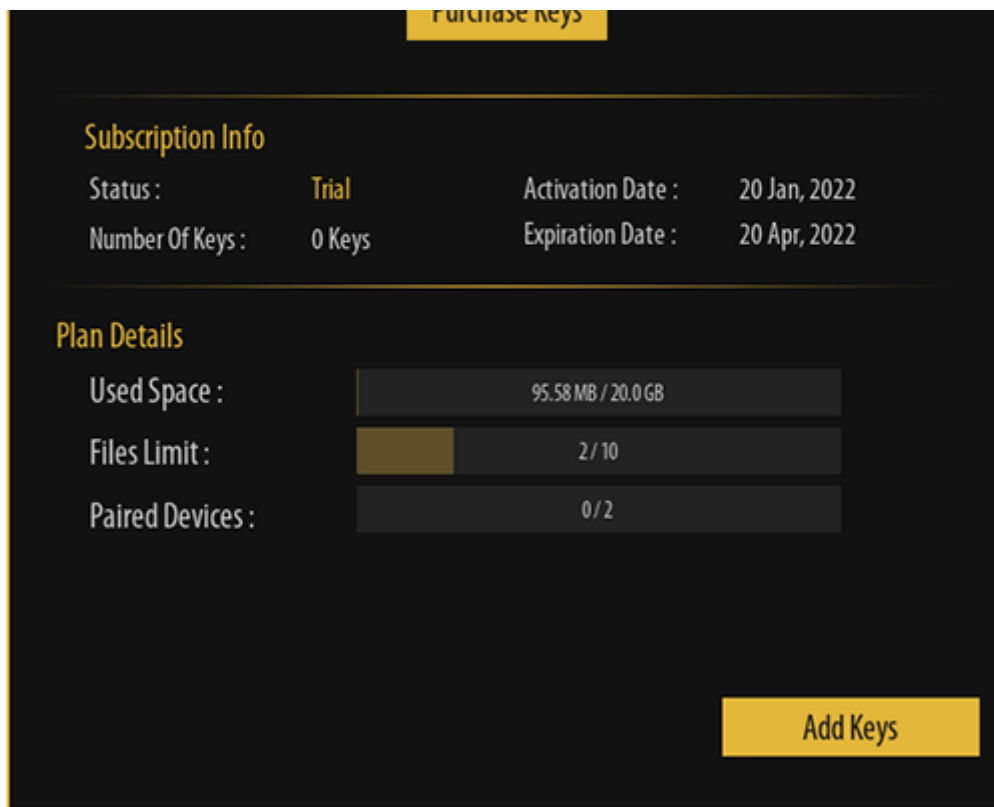
SimLab Cloud Sharing Plan